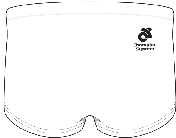
Back View :